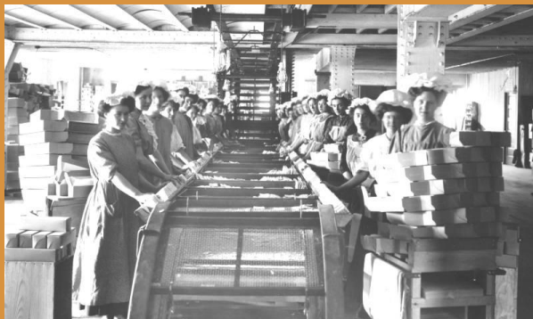
Workers at Denver Bisquit Co, circa 1900

Click on these links or scroll down for this week's announcements: