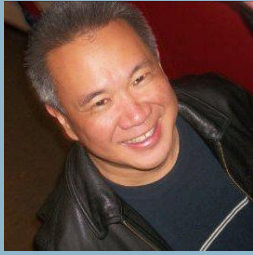
Clay Fong, Boulder Daily Camera Food Critic