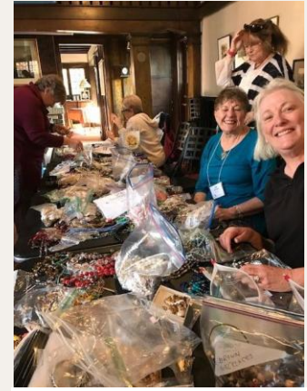
volunteers hard at work sorting baubles and jewels!

Post the flyer on bulletin Boards, share on your Facebook page, email to everyone you know!