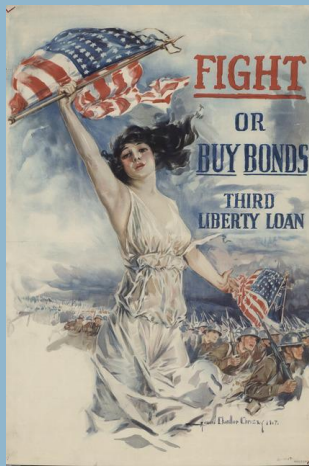
World War I Bond poster

Click on these links or scroll down for this week's announcements: