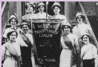
Women's Trade Union Unity League, founded in 1903

Where Professional Women Writers Connect – Founded in 1898