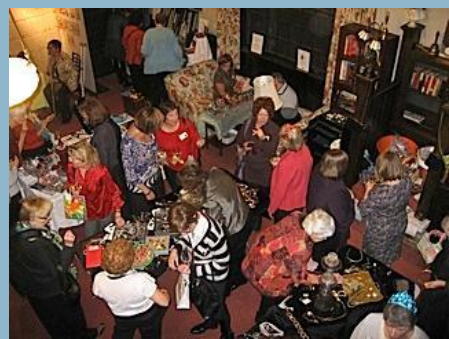
Thongs attend DWPC's annual jewelry sale fundraiser each November.

We raised more than $10,000 for our scholarship fund this year! Many thanks to everyone who sorted, untangled necklaces, and matched loose earrings in an effort to make this event fun and a successful fundraiser for scholarships for aspiring young writers.