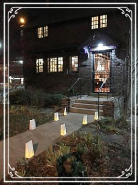
DWPC Clubhouse gleaming with luminarias.