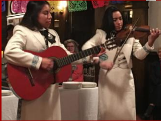
Mariachi musicians perform at DWPC's first ever holiday fiesta.