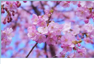
Spring Cherry Blossoms

Click on these links or scroll down for this week's announcements: